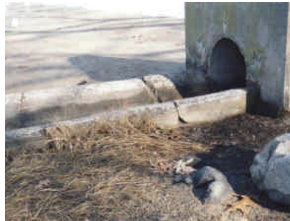
SRICD's design plan will greatly reduce the pollution now traveling into the Narrow River via the Mettatuxet Beach Outfall, shown above.

Coastal Resources Management Council, the plan will be implemented in the coming year.