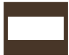
Brown / White / Brown