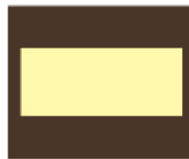
USFS Brown / Cream / Brown