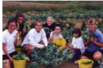
Kids Grow! Students at Harvest Time

The Kids Grow! Club at the Middle School has taken a pivotal role in planning, and has instituted and expanded a successful recycling and composting program (compost is used to enrich the garden), expanded the program into Ashaway, and designed Power Point presentations. Two members addressed the faculty of the